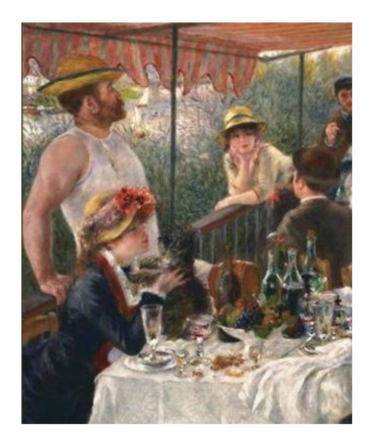
Le déjeuner des canotiers, by Auguste Renoir, 1880