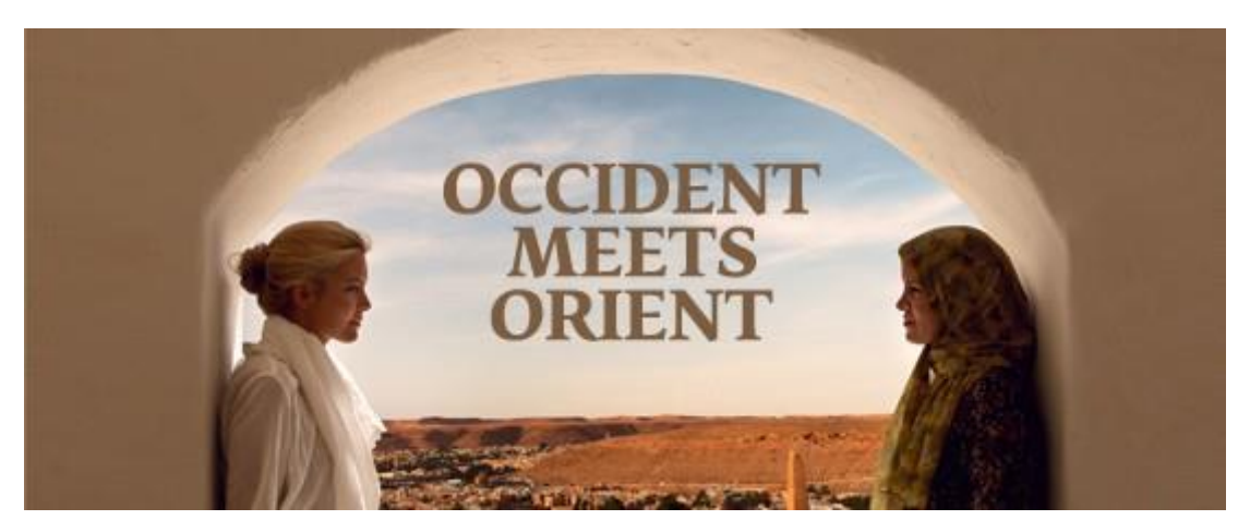
http://www.talis-teppiche.de/brand/wp-content/themes/talis-teppiche/timthumb.php?src=http://www.talis-teppiche.de/brand/wp-content/uploads/2012/07/talis teppiche occident meets orient news.jpg&w=550&h=220&zc=1

There was no panel discussion, but the participating teachers could share opinions on the present image of Turkey in western European countries with the vice president of the university and the mayor of Uşak.